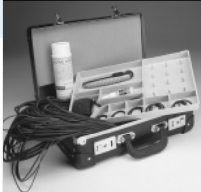
O-ring Splicing Kit

An O-ring splicing kit is a universal tool to prepare and repair cord rings. The Service Kit contains 15 feet (5 meter) of NBR 70°shore A cord in various thicknesses: .070 inch (1,78 mm), 2 mm., .103 inch (2,62 mm), 3 mm, .139 inch (3,53 mm), 4 mm, 5 mm, .210 inch (5,33 mm), 6 mm and .275 inch (7 mm). Also included is Sicomet glue, a cutting tool, a measuring tool, scour spray etc. It is possible to also supply the kit with Fluoroelastomer FKM cord instead of NBR.